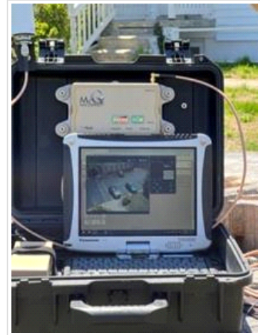
McQ CONNECT Mobile Kit